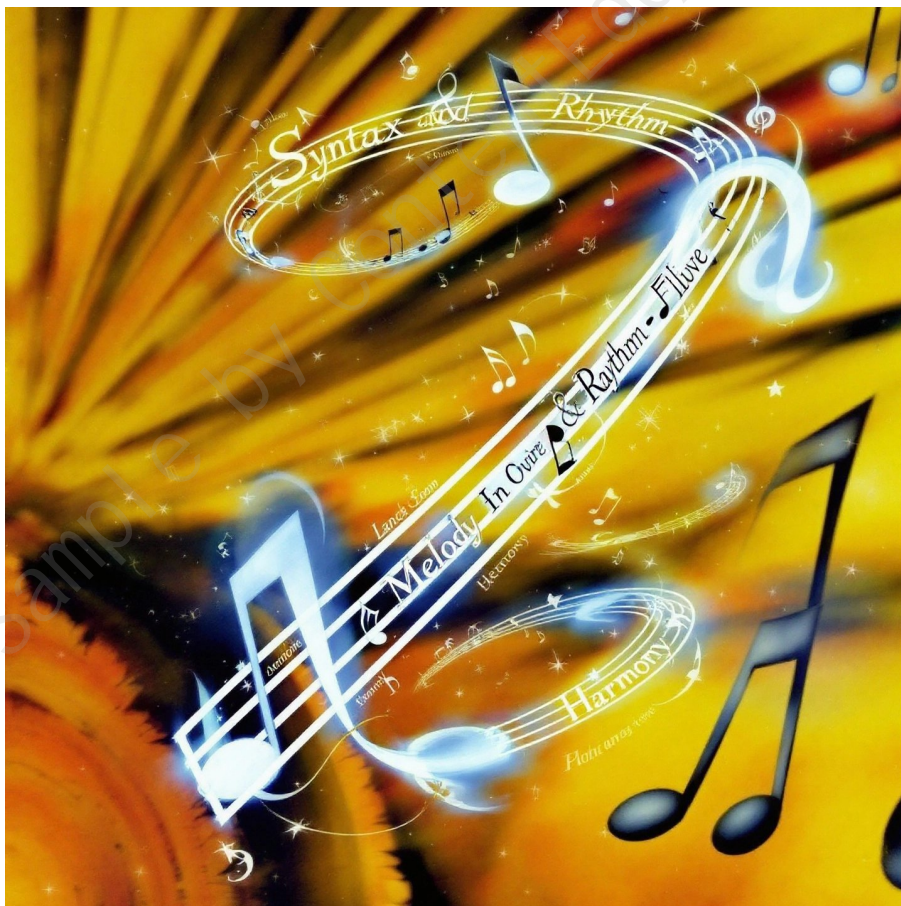
Junia AI transforms text into country music melodies (AI-generated)

As we continue our exploration of AI music generators, Soundverse AI Beat Maker stands out for its ability to blend the old with the new, providing a bridge between traditional country sounds and cutting-edge technology. Next, we'll delve into Junia AI Music Generator, where words transform into melodies, opening yet another door to creative possibilities.